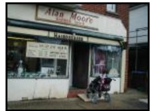
Wheelchair user access 12.04

The Disability Discrimination Act (DDA) is a civil law and interpretation of it will be determined by judges when cases are brought against service providers. Once a body of case law exists, disabled people and service providers alike will have a much clearer idea of what adjustments need to be made. Source - OUCH! 13.01.05 Disability magazine on the web: www.bbc.co.uk/ouch/