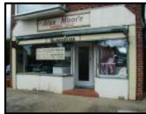
No wheelchair user access 08.04